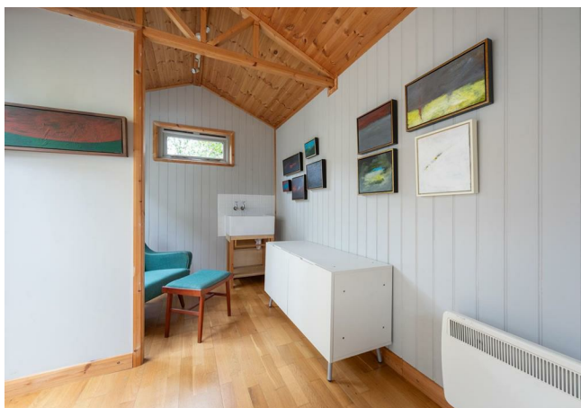
Bedroom 11'10" x 11'1"