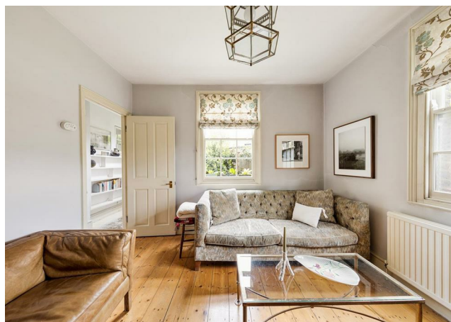
Reception Room 11'10" x 10'11"